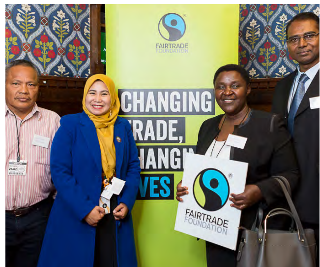
The Fairtrade Foundation aims to give producers a voice – four producers attended the 2018 Fairtrade reception in parliament.

There is also a calculation to be made between the potential benefit of pursuing these opportunities independently outside of an EU Customs Union, and the additional costs and disruption that may arise from running an independent trade policy (for example the ‘Facilitated Customs Arrangement’ or FCA), and from leaving the Single Market. As previously noted, there is a high risk that additional costs are pushed onto producers who all too often have the least power to negotiate within a particular supply chain. 35 Moreover, these producers often do not receive protection from their national governments against the worst effects of the power asymmetry in many grocery supply chains. Revisiting the scope and remit of the ‘Groceries Code Adjudicator’ (GCA) to cover farmers and producers further up the supply chain, including those in developing countries, may go some way to protect suppliers at this uncertain time. Alternatively, the Government could introduce new statutory codes of conduct as part of the powers introduced by the Agriculture Bill. 36 Without action, there is a risk that more producers will see their incomes reduce, risking increases in poverty or the adoption of increasingly unsustainable farming practices.